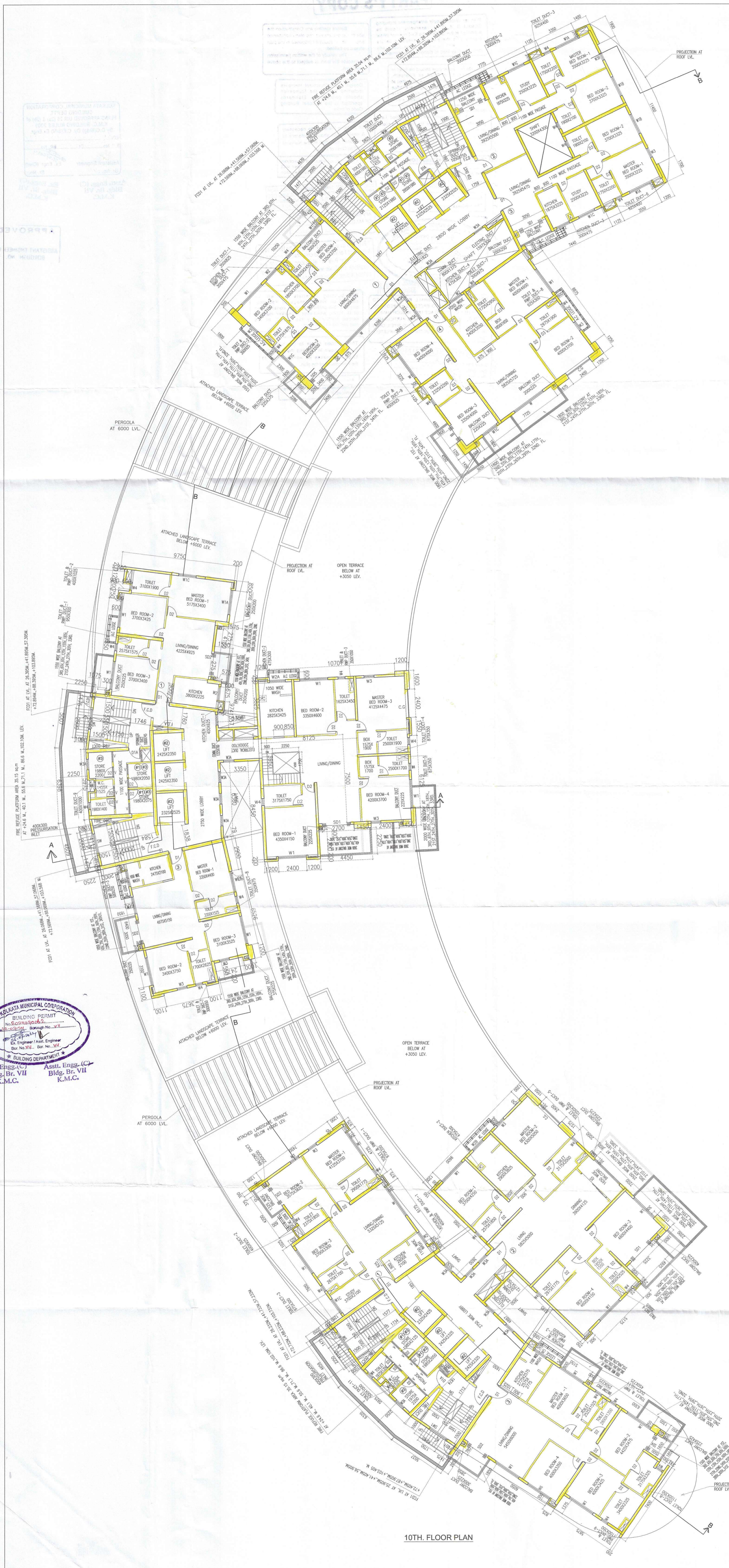
10TH. FLOOR PLAN